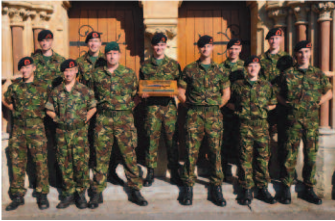
Our Royal Marines with the highly coveted Sir Steuart Pringle Trophy, which they won for the second year in a row.