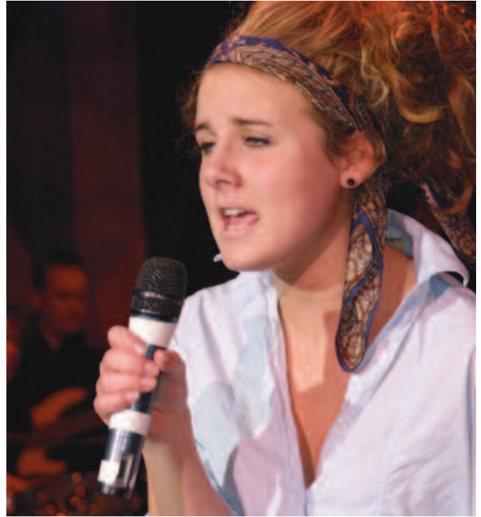
This year's school musical was a stylish and inventive re-working of A Midsummer Night's Dream . More pictures on page 3.